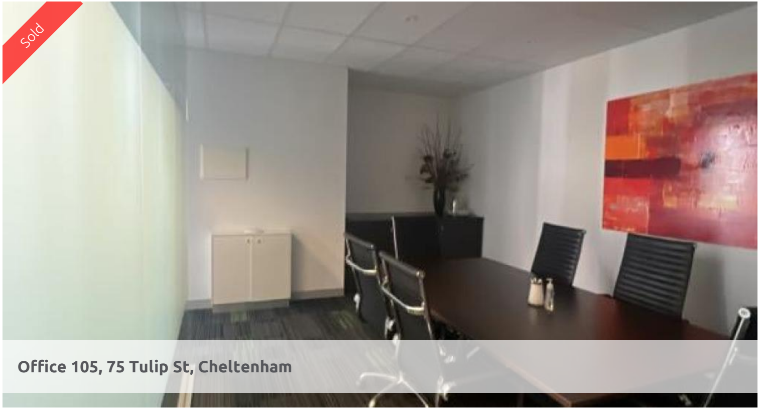
Office 105, 75 Tulip St, Cheltenham