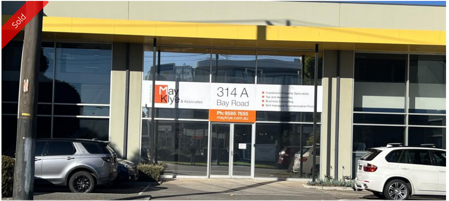
314A Bay Rd, Cheltenham