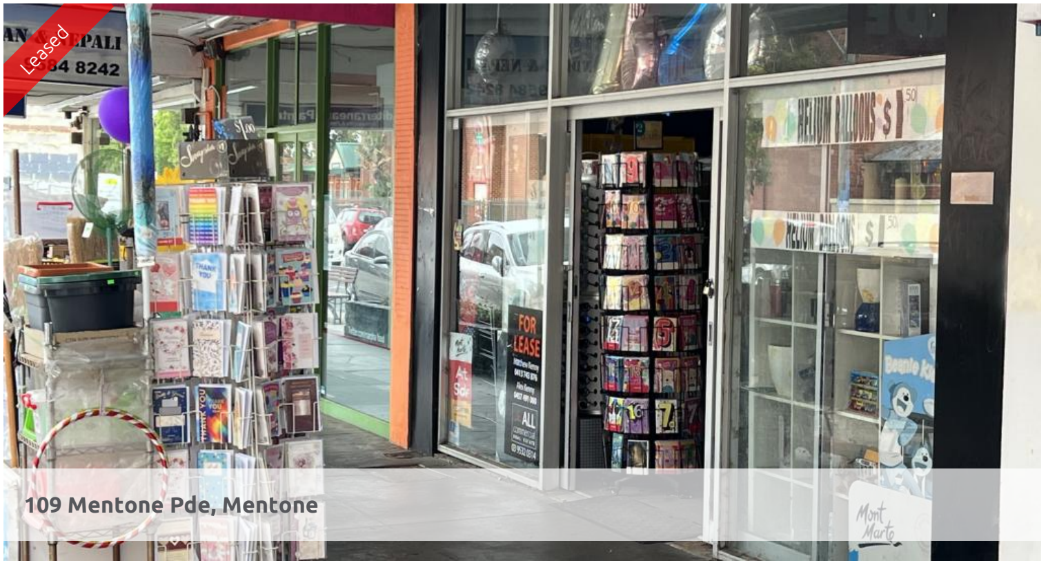
109 Mentone Pde, Mentone