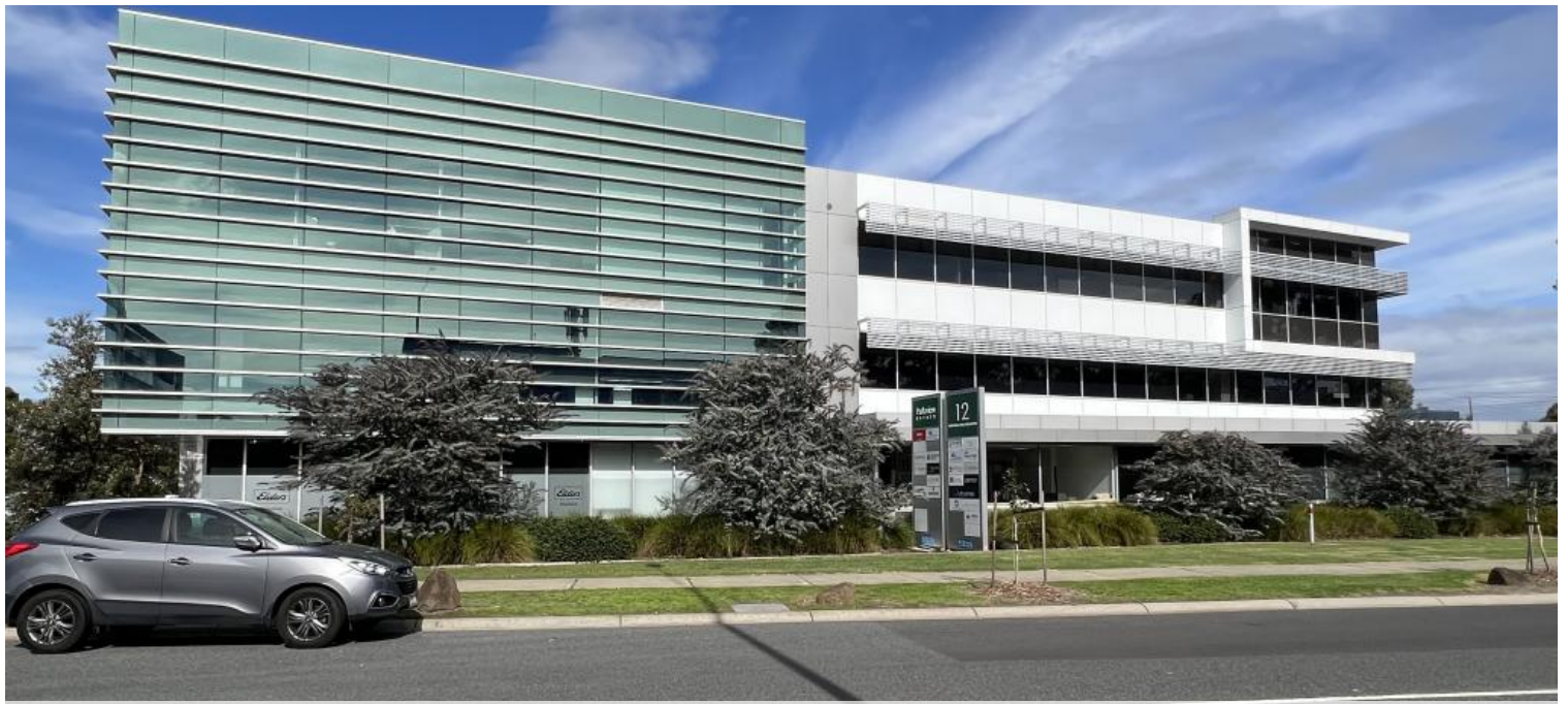
Unit 207, 12 Corporate Dr, Heatherton