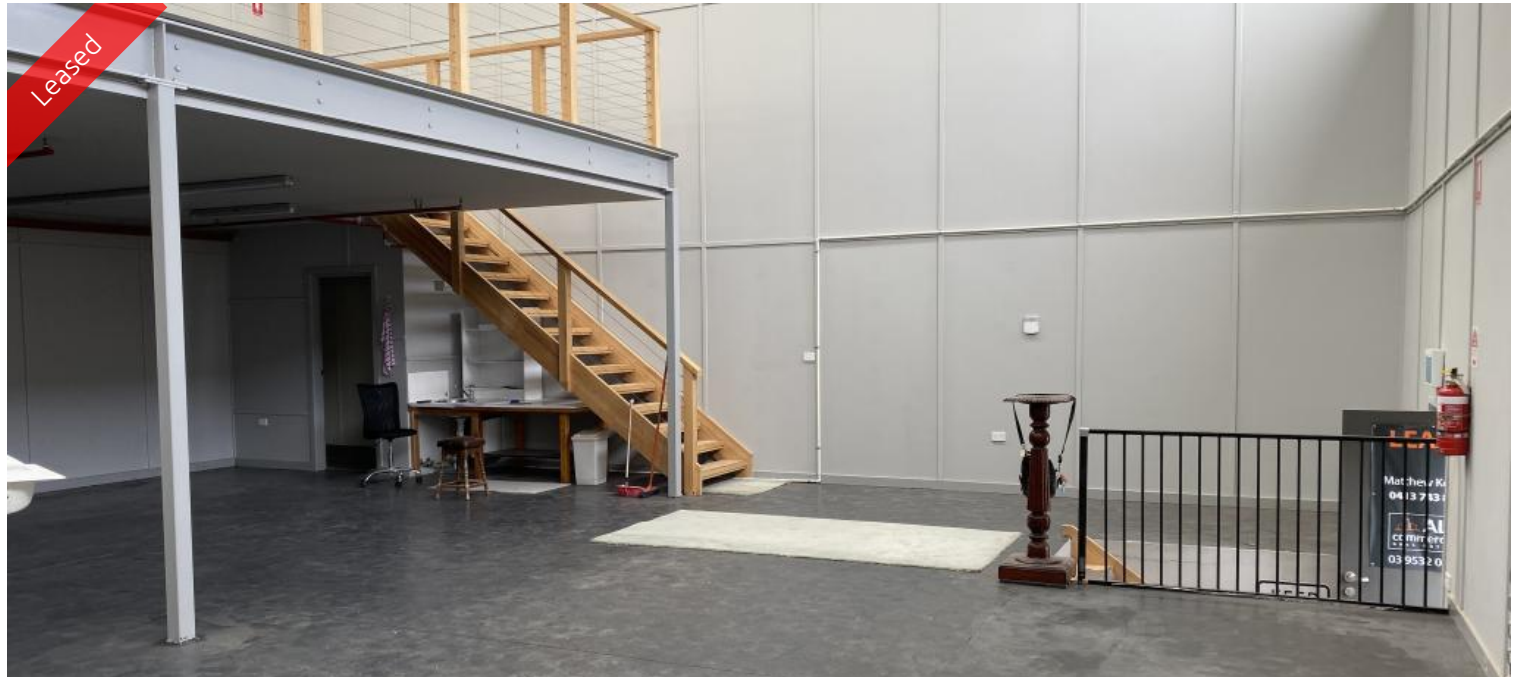
Unit 35, 9-19 Levanswell Rd, Moorabbin