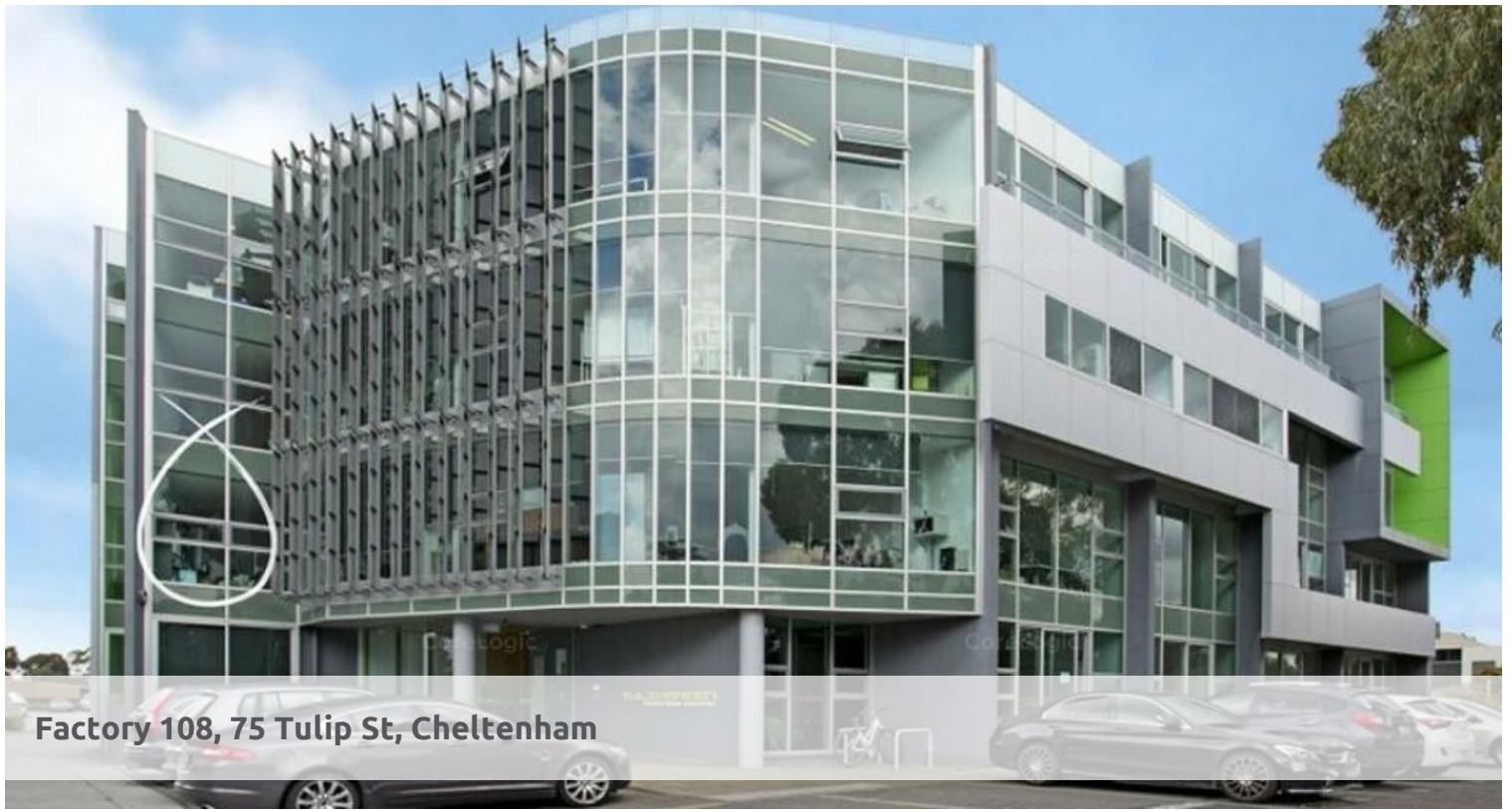
Factory 108, 75 Tulip St, Cheltenham