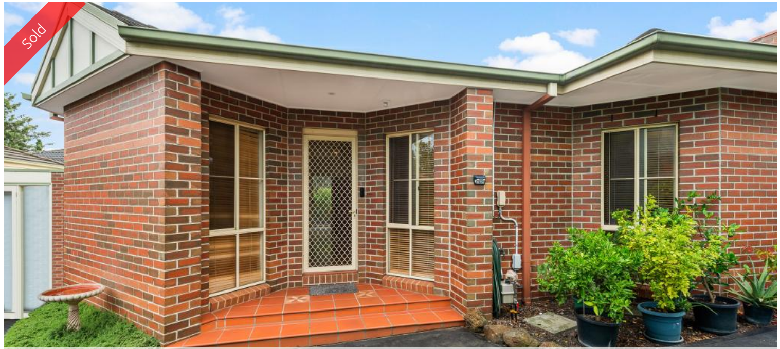
Unit 2, 33 Worthing Rd, Highett