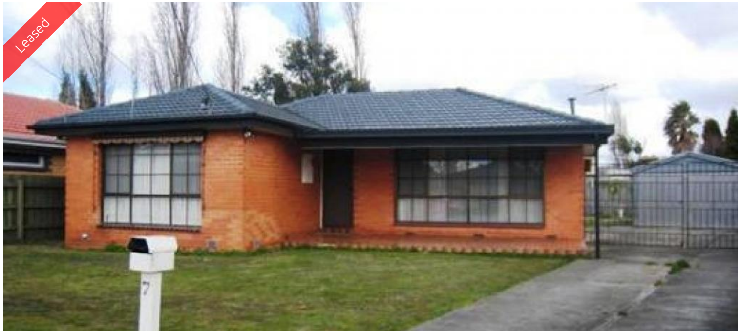
7 Badger Ct, Thomastown