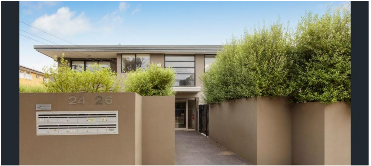
Unit 3, 24 Holloway St, Ormond