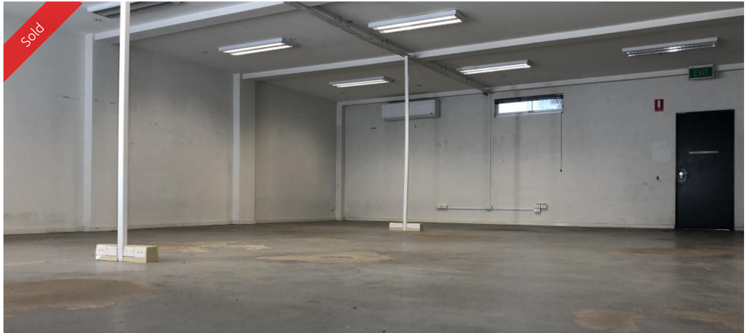
Unit 1, 79-80 Beach Rd, Sandringham