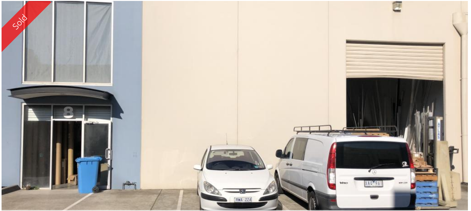
Factory 8, 3 Dunlop Ct, Bayswater