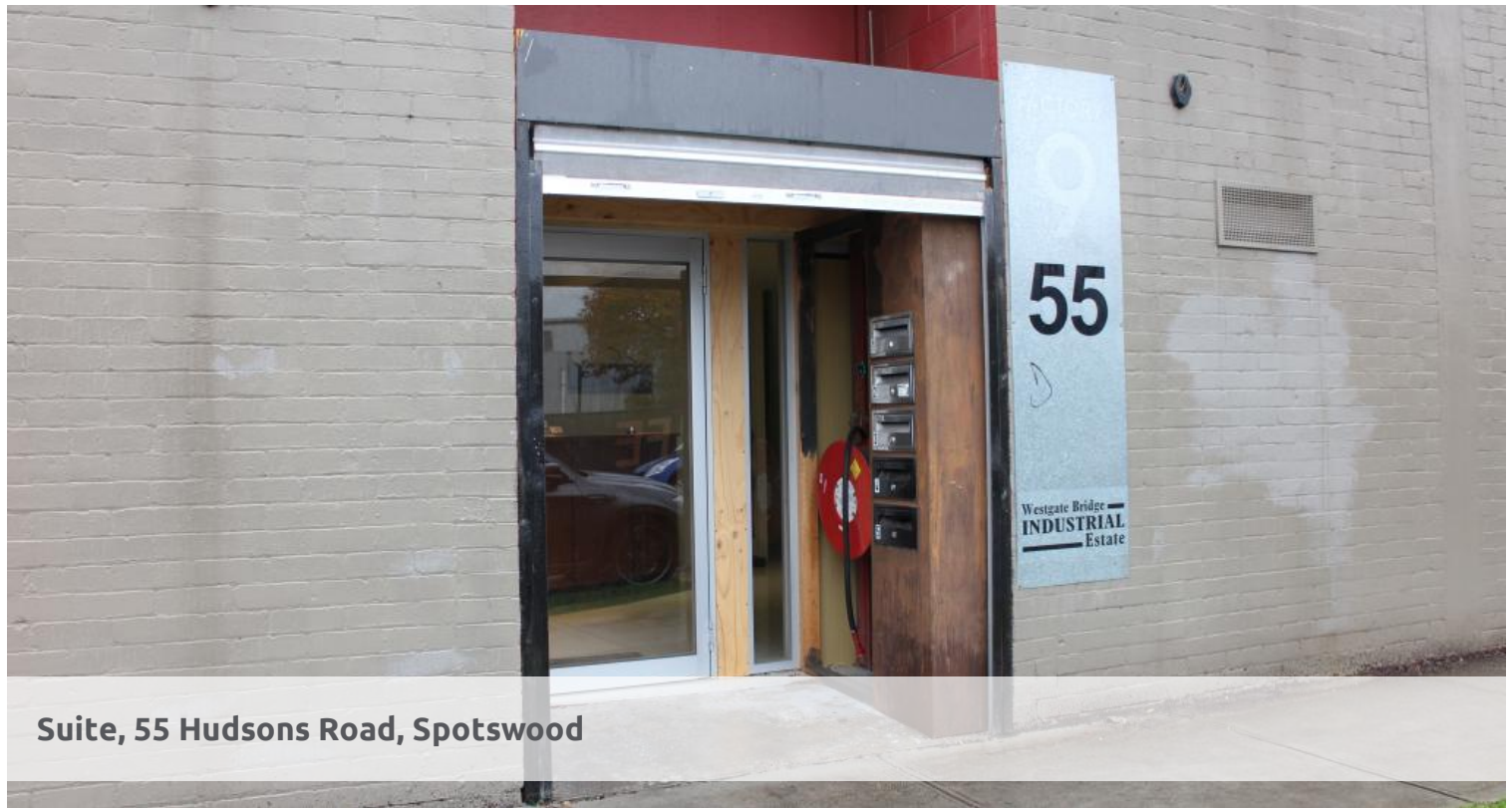
Suite, 55 Hudsons Road, Spotswood