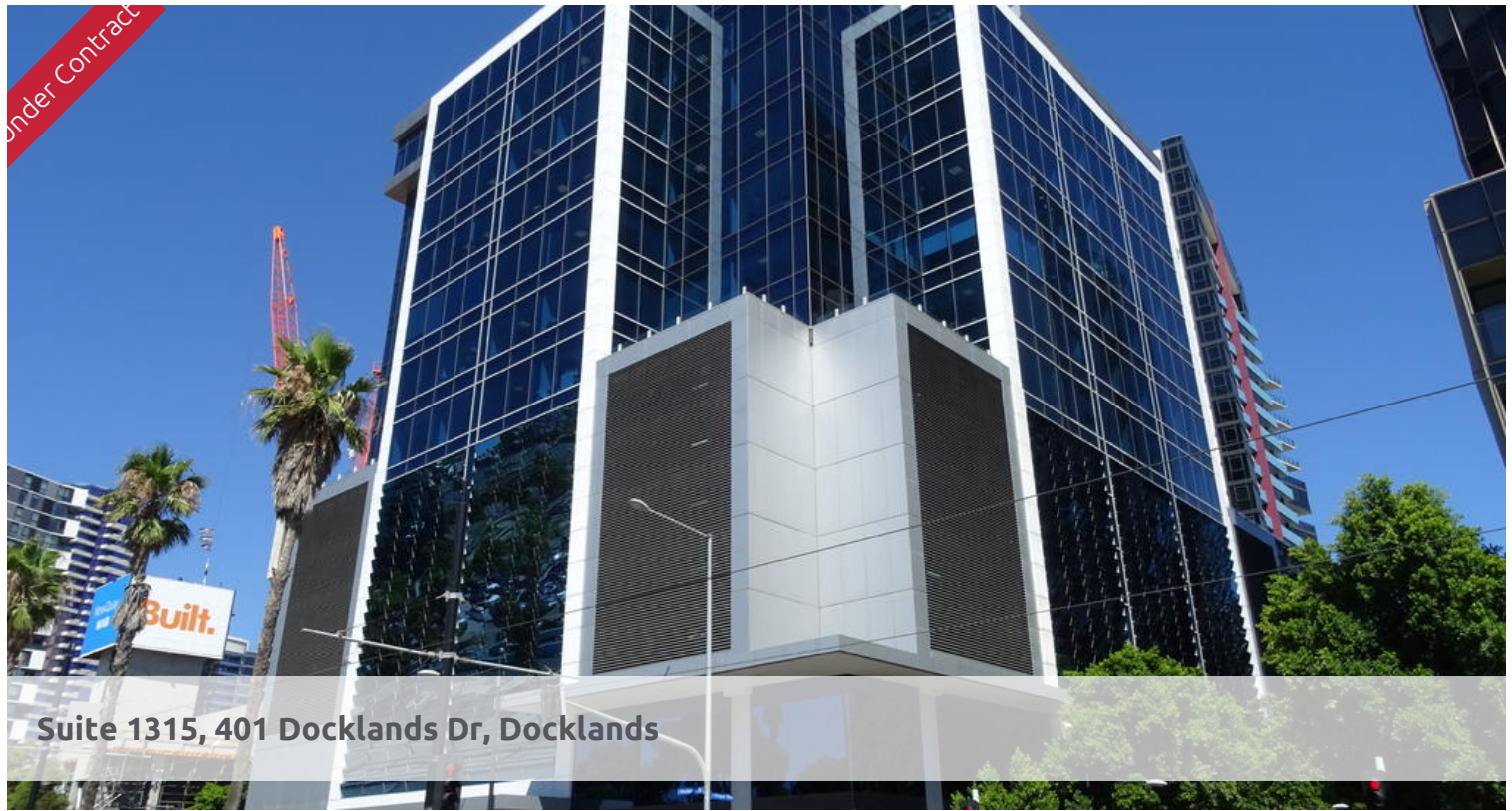
Suite 1315, 401 Docklands Dr, Docklands