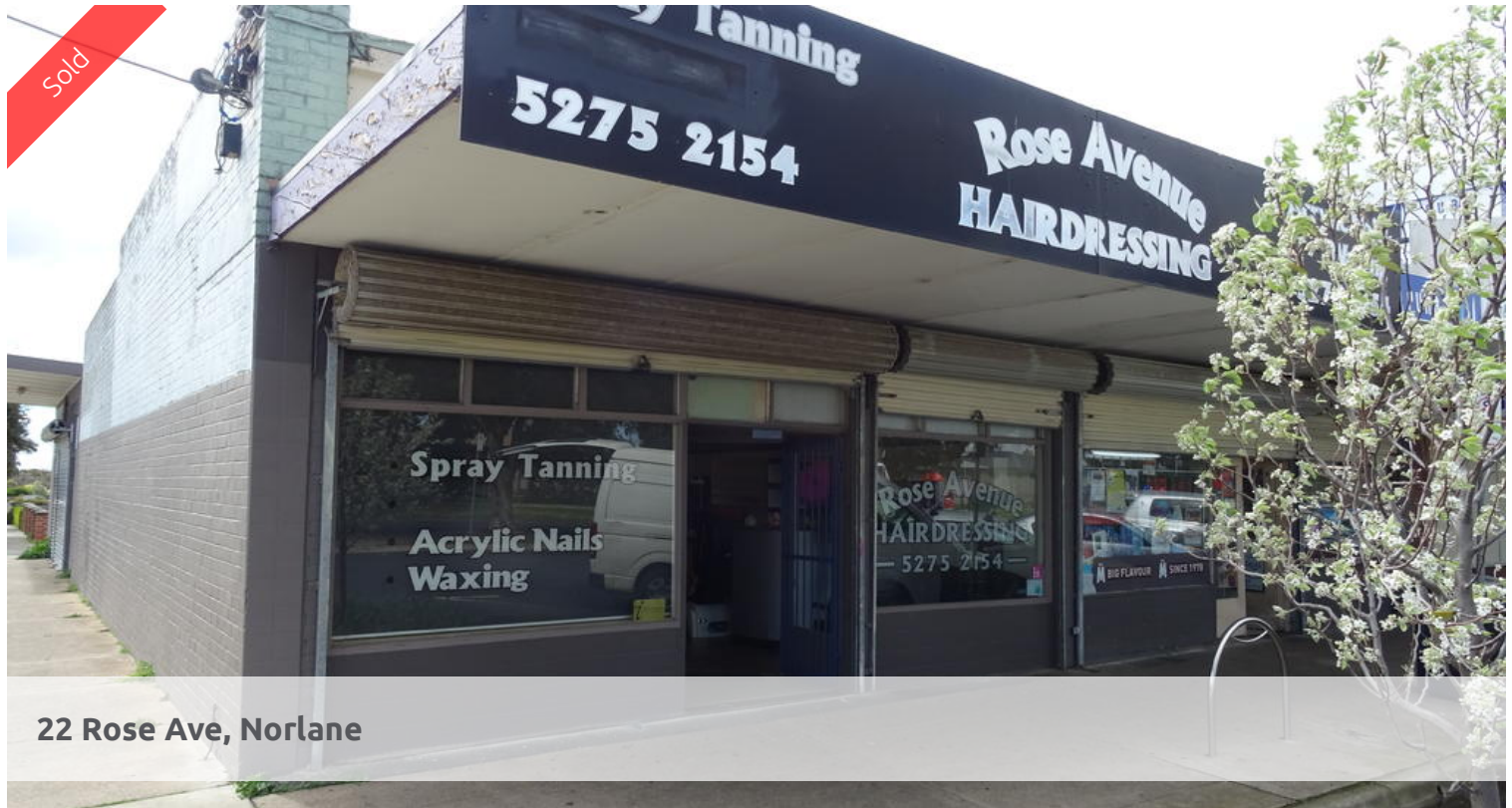
22 Rose Ave, Norlane