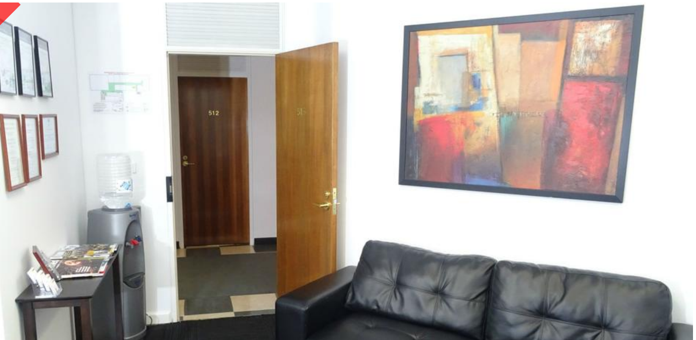
Suite 516, Lot 370 St Kilda Road, Melbourne