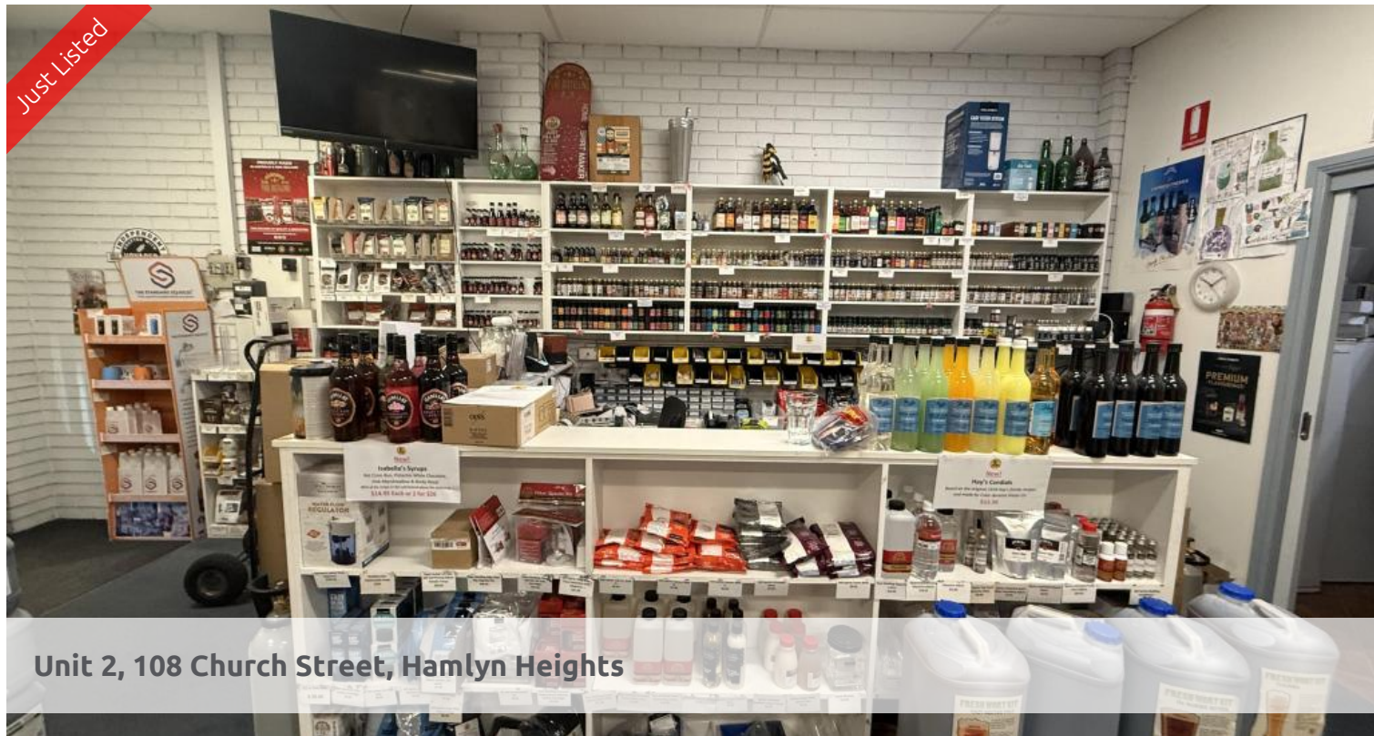
Unit 2, 108 Church Street, Hamlyn Heights