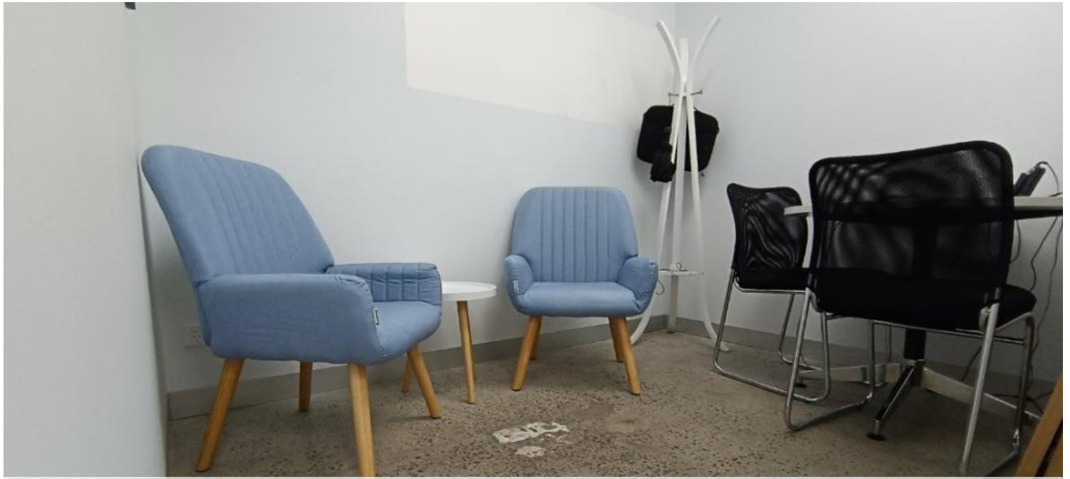
Suites 1 And 2 5, 378 Glenhuntly Road, Elsternwick