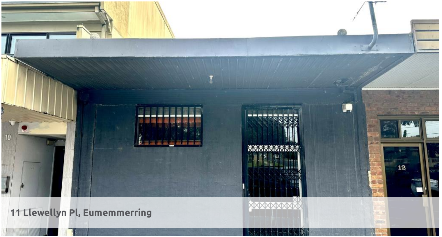
11 Llewellyn Pl, Eumemmerring